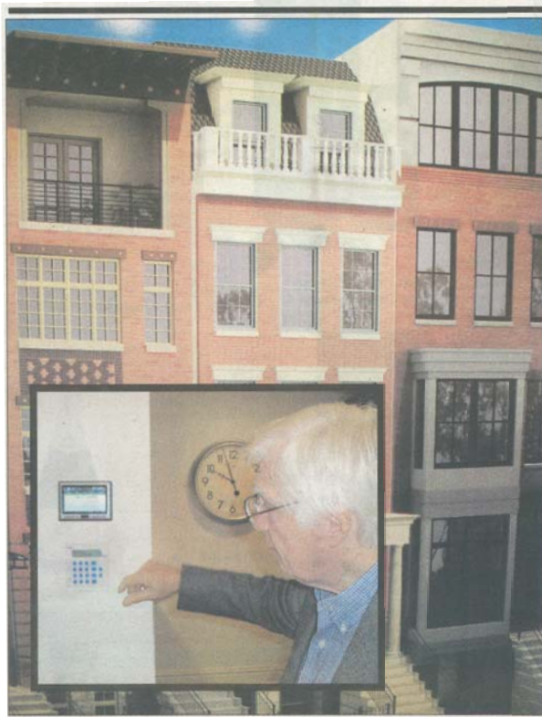
THIS IS LIBERTY HARBOR – Liberty Harbor North is an 80-acre residential community being built in Downtown Jersey City. These are some of the townhouses located in Liberty Harbor.