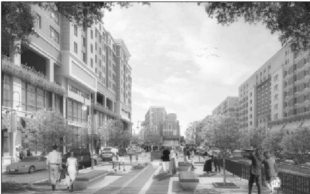
Liberty Harbor in Jersey City redefines urban living with five distinctive product types, retail offerings, comprehensive amenities, state-of-the-art technology and a wealth of public transportation options.

For more information, visit Liberty Harbor's on-site sales office at 333 Grand St. in Jersey City. ◆